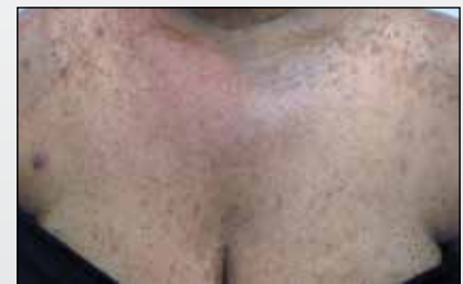
Before and after NewSurg KTP Tx